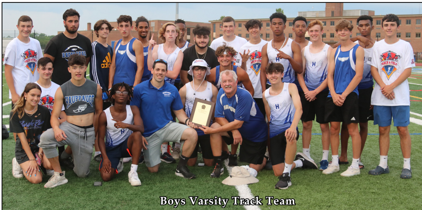
Boys Varsity Track Team